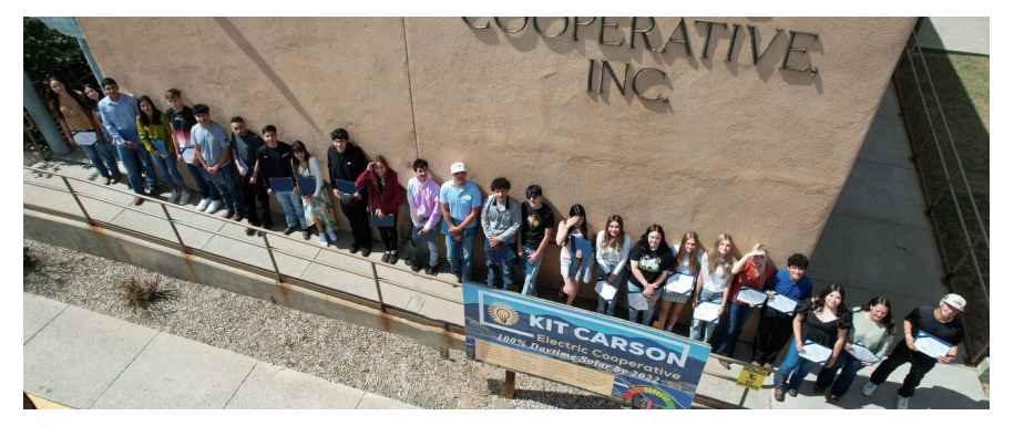
2024 KCEC Scholarship Recipients